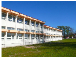
Before/after energy efficient retrofit: A school refurbished under a KfW-financed programme