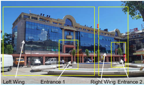
Ministerial complex in Podgorica, Montenegro

Fraunhofer IBP's experts have a long experience with energy-efficient, sustainable construction and housing. They design, support and evaluate energy concepts for high-performance buildings or districts and develop concepts for energy supply and climate protection, including long-term roadmaps for cities and municipalities.