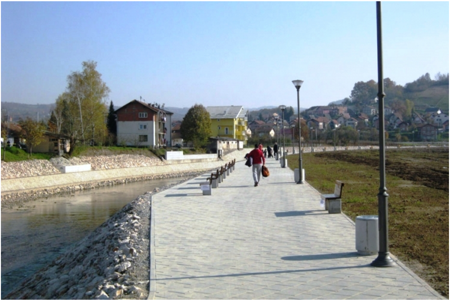
Reconstructed banks of Vrbanja River (c) EU.