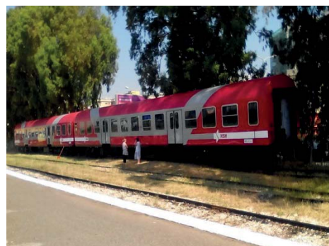
Durrës Railway Station, Albania.

This investment project concerns the rehabilitation of the Tirana - Durrës railway section and the construction of a new railway link to the Tirana international airport, including signalling and telecommunication systems. It is part of a Core Corridor on the indicative extension of the Trans-European Transport Network (TEN-T) to the Western Balkans.