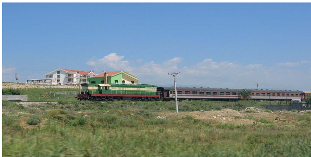
HSB Train nearby Durrës.