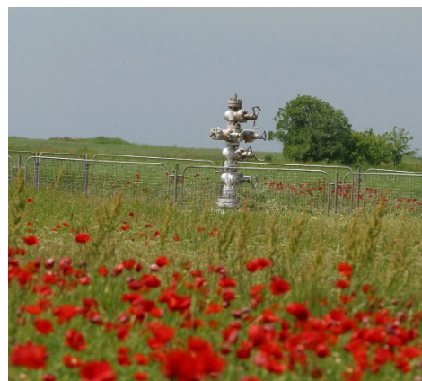
Existing gas network in Serbia.

This investment project 1 concerns the construction of approximately 108 kilometres of bi-directional gas pipeline between Niš and Dimitrovgrad as well as from Dimitrovgrad to the border with Bulgaria. The new development will cater for about 2 billion cubic metres per year and will thus contribute to the diversification of energy sources to Serbia and the wider Western Balkan region, as well as to the creation of trans-European energy networks.