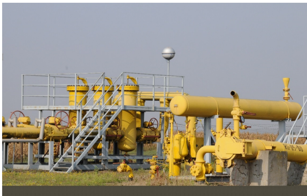
View of existing facilities in Serbia, which would be connected to the Serbia – Bulgaria gas interconnector, once complete.