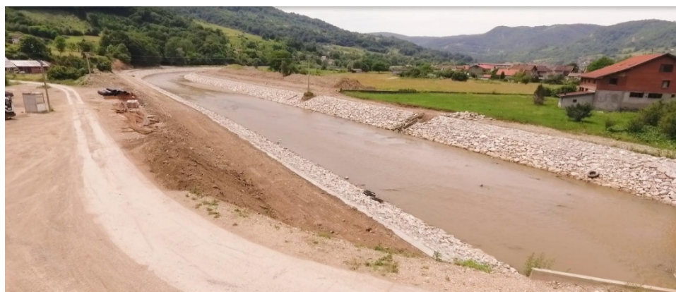
Rehabilitated Drinjaca River in Sekovici