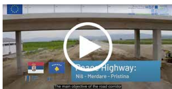
June 2023 Peace Highway Serbia-Merosina section Watch here >>