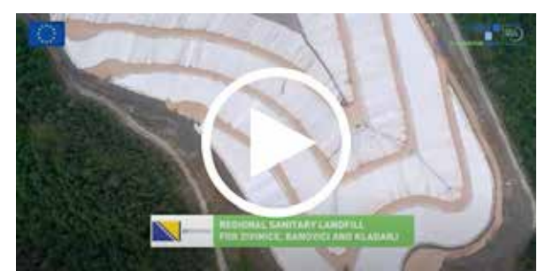
July 2023 Regional Landfill Živinice, Bosnia and Herzegovina Watch here >>