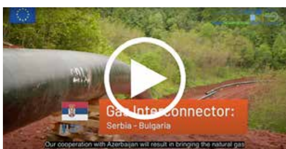
June 2023 Gas Interconnector Serbia-Bulgaria Watch here >>