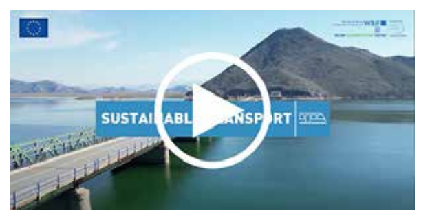
July 2023 Bar Vrbnica Rail Interconnection, Montenegro Watch here >>