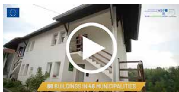
July 2023 Housing and Social Integration of Vulnerable Persons, Bosnia and Herzegovina (Kladanj) Watch here >>