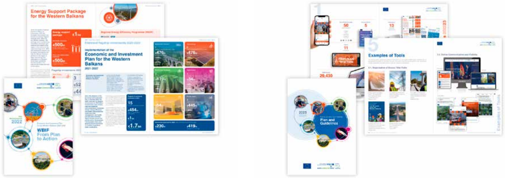
From Plan to Action - WBIF Key Achievements 2022 Communication & Visibility Plan and Guidelines