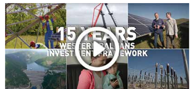
WBIF 15 Years