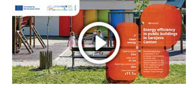
WBIF Flagships Overview